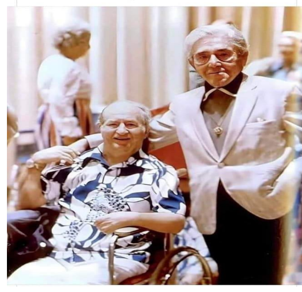
The last photo of Larry fine and Moe Howard of The Three stooges

Comic actor Joe DeRita became "Curly Joe" in 1958, replacing Besser for a new series of full-length theatrical films. With intense television exposure in the United States, the act regained momentum throughout the 1960s as popular kids' fare, until Larry's paralysing stroke in the midst of filming a pilot for a Three Stooges TV series in January 1970. He died in January 1975 after a further series of strokes. Unsuccessful attempts were made in 1970 and 1975 to revive the act with longtime supporting actor Emil Sitka in Fine's role, but they were cut short by Moe Howard's death on May 4, 1975.